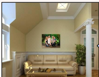
30 x 40 Canvas Gallery Wrap

These are common questions that we all face when decorating our homes. From artistic wall décor to family wall portraits, it's a valid concern and one that many people cannot visualize without some assistance. Fortunately during your ordering session you will see exactly the size of YOUR portraits and how they will look on YOUR wall space at the exact dimensions! Contact me for details or view the comparison pictures below of real wall space with one of my family portraits projected virtually into the space!